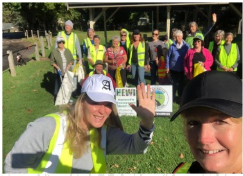
Clean Up Day HEWI & No Reason 4 Rubbish members