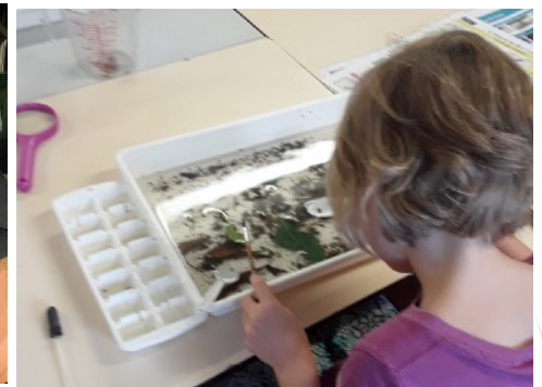
Family Waterbugs Workshop participant