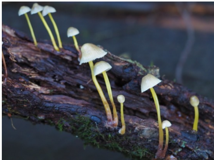
Yellowleg Bonnet Mycena epipterygia  taken at Wirrawilla Rainforest Walk, Toolangi

Reduce your home energy consumption by up to 15% by real-time monitoring via your phone using a free Powerpal device, and get the best deal on what energy you use by comparing various providers of electricity and gas. Some consumers, including pensioners, are eligible for a Power Saving Bonus of $250.