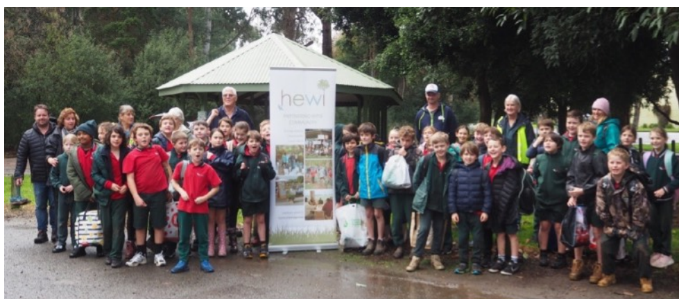
Happy HPS planters