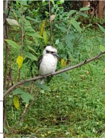
Kookaburra dining after weeds cut back