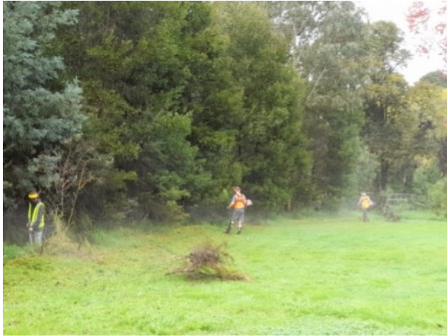
Healesville RSL student volunteers