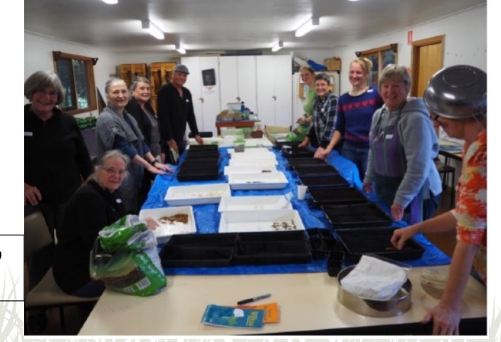
Seed Workshop participants and Coral