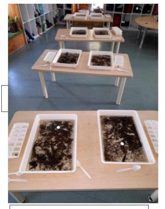
Set up at Robyn Jane Children's Centre