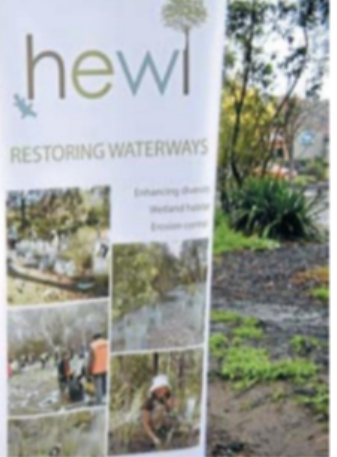
Karin Traeger is running 280km from the river to the bay and meet with HEWI committee member Lou Sbaichiero in Healesville along the journey.