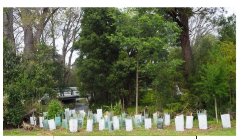
Some of the Healesville High plants