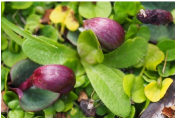
Corybas aconitiflorus (Spurred Helmet Orchid)