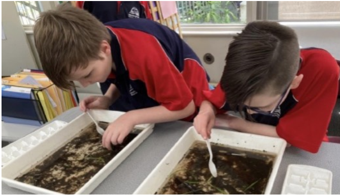
Warburton Primary School session