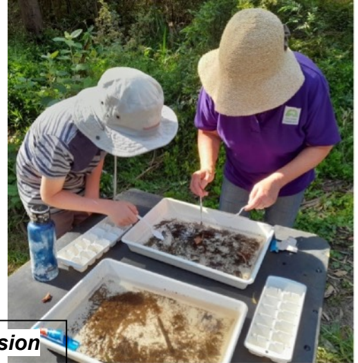
Millgrove Community session