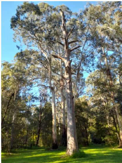
Dead hollow tree with Sugar Glider

We held a hollow tree survey along Badger Creek between the Bluegum Reserve and Badger Creek Road in October with the Badger Creek Community and Mt Toolebewong & District Landcare. We commenced with light refreshments and a presentation at the Badger Creek Old School, and then drove to Bluegum Drive and positioned one or two people by dead or living Manna Gum trees with hollows. We saw one Sugar Glider, four Ringtail and six Brushtail Possums, and several microbats.