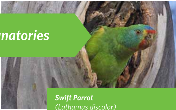
Swift Parrot ( Lathamus discolor )