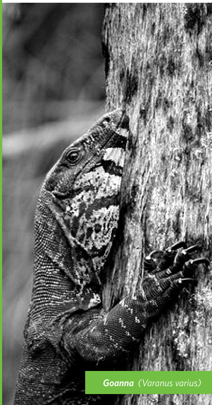
Goanna ( Varanus varius )

Native forest logging on public land should end. If any native forest logging is proposed in the future it should be subject to commonwealth environmental laws in the same way as every other industry, not exempted through the RFA regime.