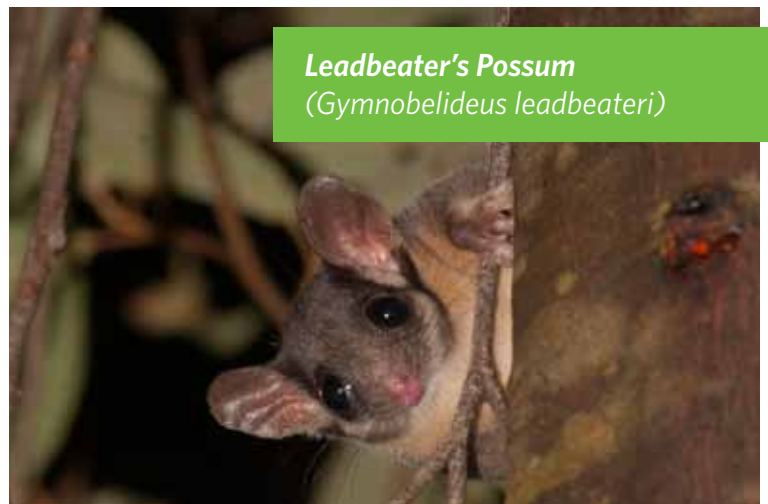
Leadbeater's Possum ( Gymnobelideus leadbeateri )

South Brooman State Forest, NSW Forest Red-tailed Black Cockatoo ( Calyptorhynchus banksii naso) Goanna ( Varanus varius) Leadbeater's Possum ( Gymnobelideus leadbeateri)